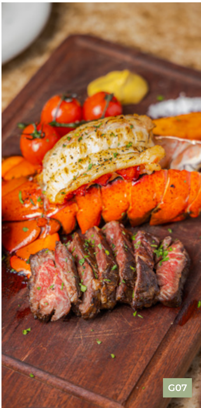
G07 Grilled Lobster Tail with Wagyu Beef Skirt Steak 燒龍蝦及和牛橫隔肌