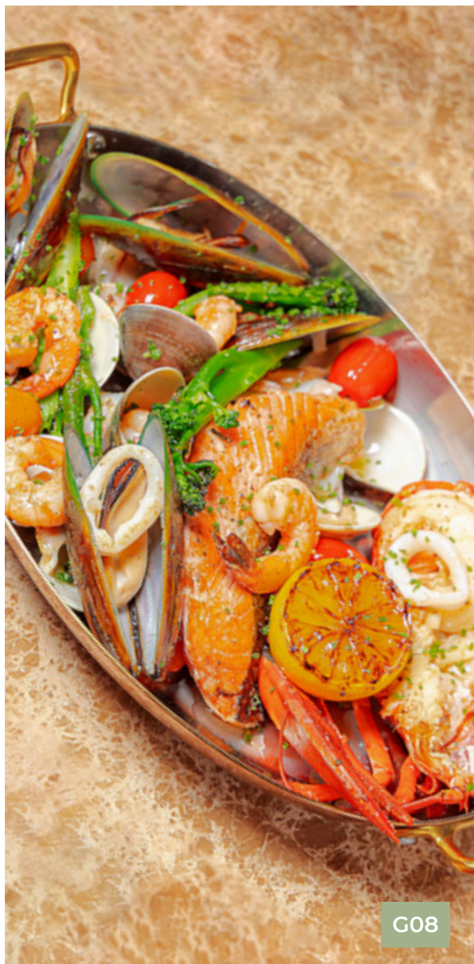
G08 Grilled Seafood Platter 烤海鮮拼盤

Boston Lobster, Mussels, Clams, Squid, Salmon, Prawns, Seasonal Vegetables