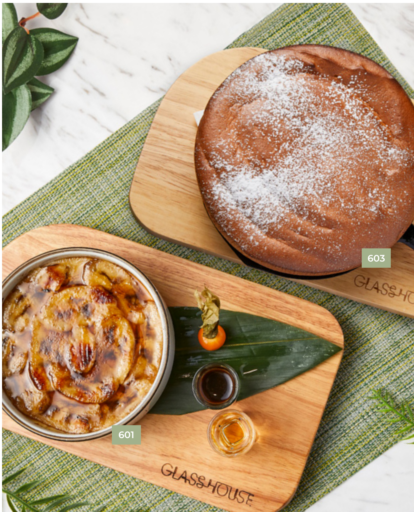
601 Banana Crème Brûlée 香蕉火焰焦糖燉蛋 Espresso, Caramel Sauce