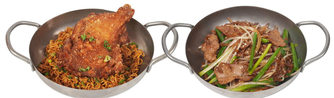
炸雞牌撈蔥油公仔麵 $88 Fried Chicken Drumsticks Noodles 乾炒牛河 $78 Stir-fried Beef Flat Noodles