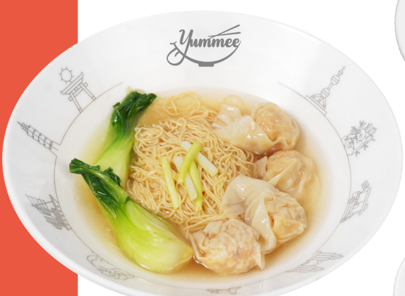
鮮蝦雲吞麵 $78 Fresh Prawn Wonton Noodles