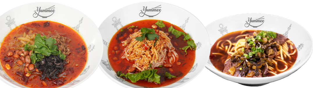
正宗酸辣粉 $78 Sour Spicy Potato Noodles 雞絲小麵 $78 Shredded Chicken Spicy Noodles 紅燒牛腩麵 $88 Braised Beef Shank Noodles