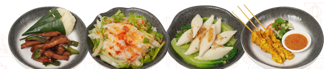
豬頸肉配糯米飯 $38 Fried Pork Neck with Sticky Rice 泰式酸辣鳳爪 $38 Sour & Spicy Chicken Claw 泰式白灼魚蛋 $38 Thai-Style Fish Balls 泰式雞肉串燒 $48 Chicken Skewers