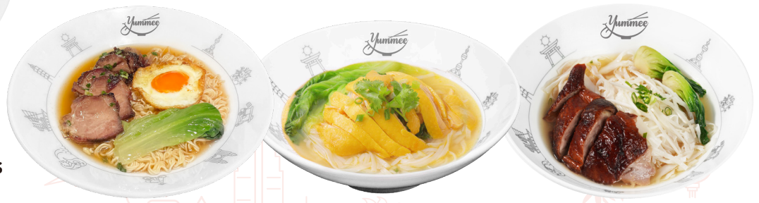
叉燒煎蛋公仔麵 $78 Char Siu Egg Instant Noodles 海南雞河粉 $98 Hainan Chicken Noodles 煙燻燒鵝瀨粉 $98 Roasted Goose Noodles