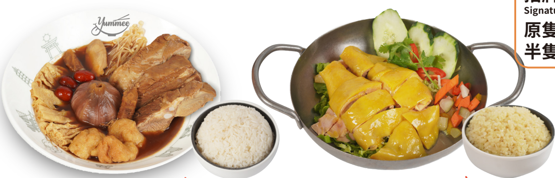
肉骨茶配飯 $98 Herbal Pork Ribs Soup with Rice 海南雞飯 $98 Hainan Chicken Rice

招牌海南雞 Signature Hainan Chicken 原隻 Whole $368 半隻 Half $188