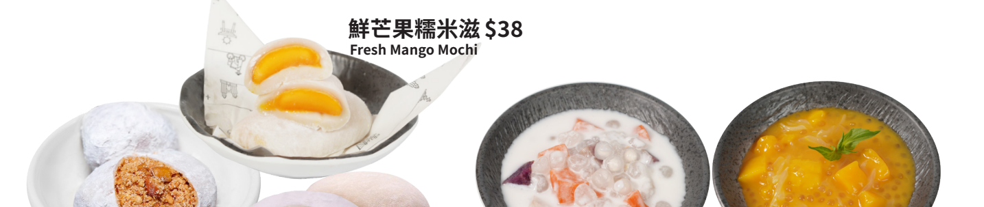
鮮芒果糯米滋 $38 Fresh Mango Mochi 花生糯米滋 $36 Peanut Mochi 榴蓮糯米滋 $38 Durian Mochi 摩摩啫啫 $36 Sweet Yam in Coconut 楊枝甘露 $36 Mango Pomelo Sago