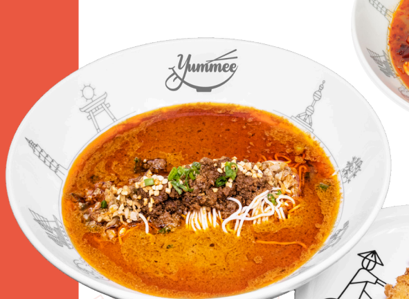
麻辣擔擔麵 $78 Spicy Dan Dan Noodle