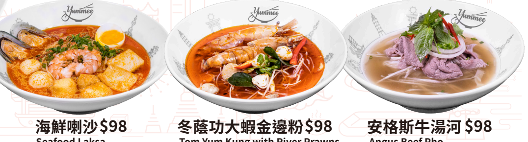
海鮮喇沙 $98 Seafood Laksa 冬蔭功大蝦金邊粉 $98 Tom Yum Kung with River Prawns 安格斯牛湯河 $98 Angus Beef Pho