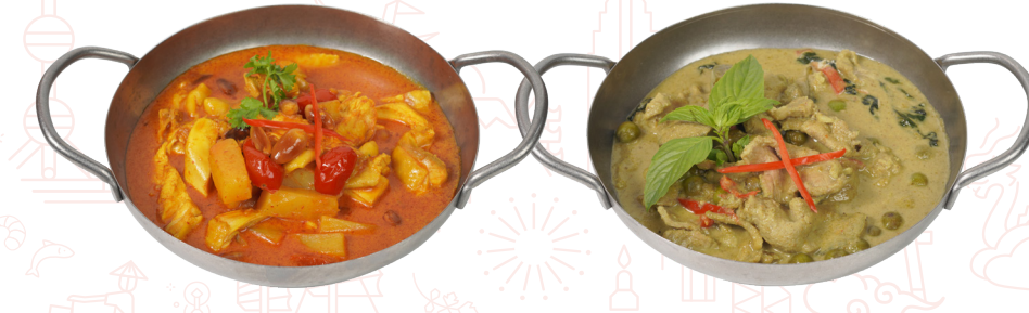
黃咖喱雞肉飯 $88 Yellow Curry Chicken with Rice 青咖喱豬肉飯 $88 Green Curry Pork with Rice