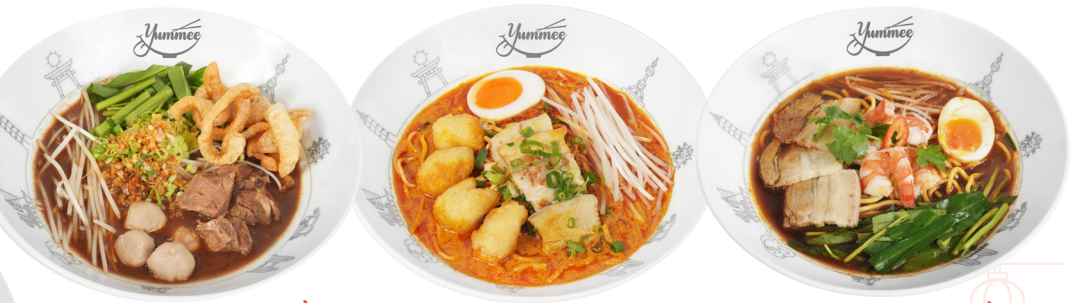
牛腩船麵 $88 Beef Brisket Boat Noodles 傳統喇沙麵 $88 Traditional Laksa 濃湯蝦麵 $88 Prawn Noodles