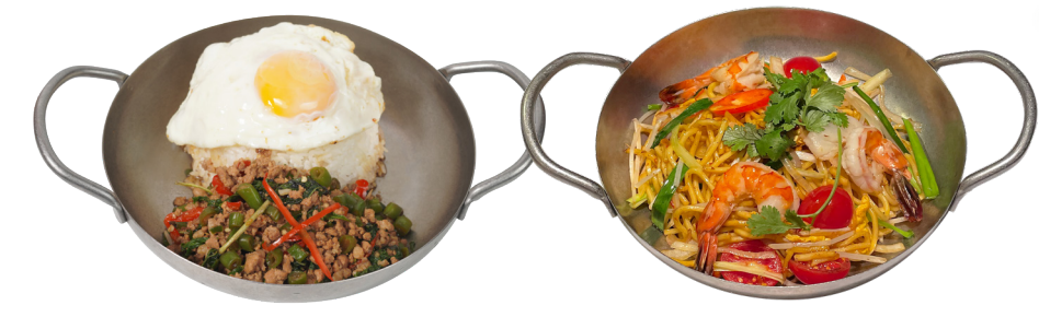
金不換炒豬肉/雞肉碎飯 $88 Basil Minced Pork/Chicken Rice 馬來鮮蝦炒麵 $88 Malay Stir-Fried Noodles