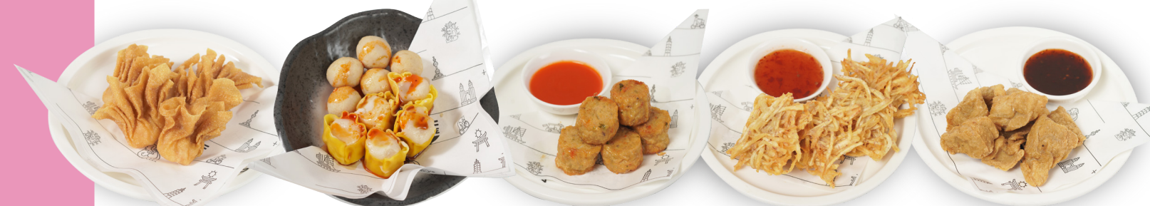
炸雲吞 $38 Deep Fried Wonton 魚蛋拼魚肉燒賣 $38 Fish Balls and Siu Mai 脆炸雞肉腸 $38 Deep Fried Chicken Sausage 脆炸芋頭餅 $38 Fried Taro Bites 脆炸泰式魚塊 $38 Fried Thai Fish Cake