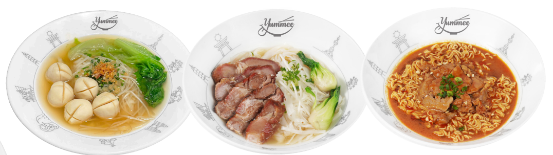
爽口魚蛋河粉 $78 Fish Balls Noodles 蜜汁叉燒瀨粉 $78 Char Siu Noodles 沙嗲牛肉麵 $78 Satay Beef Instant Noodles