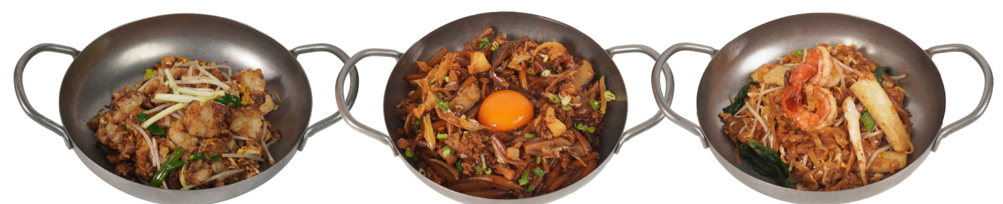
炒蘿蔔糕 $78 Stir-Fried Turnip Cake 炒銀針粉 $78 Stir-Fried Silver Needle Noodles 鮮蝦炒貴刁 $88 Stir-Fried Flat Rice Noodles

招牌海南雞 Signature Hainan Chicken 原隻 Whole $368 半隻 Half $188