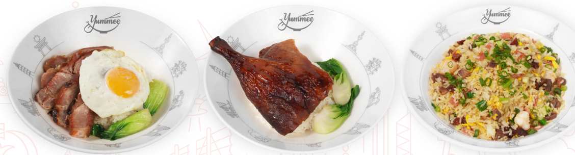
食神叉燒飯 $88 Char Siu Rice with Egg 煙燻燒鵝飯 $98 Fragrant Roasted Goose Rice 揚州炒飯 $78 Yang Zhou Fried Rice