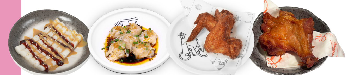
那些年腸粉 $32 Steamed Rice Flour Rolls 成都紅油抄手 $38 Dumplings in Chilli Oil 炸雞翼 $38 Fried Chicken Wings 炸原隻雞脾 $42 Fried Chicken Leg