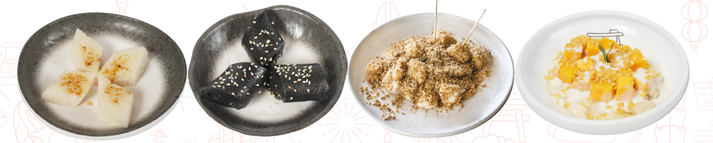
懷舊白糖糕 $28 White Sugar Cake 懷舊芝麻卷 $28 Black Sesame Rolls 糖不甩 $28 Mochi in Crushed Peanuts 芒果糯米飯 $48 Mango Sticky Rice