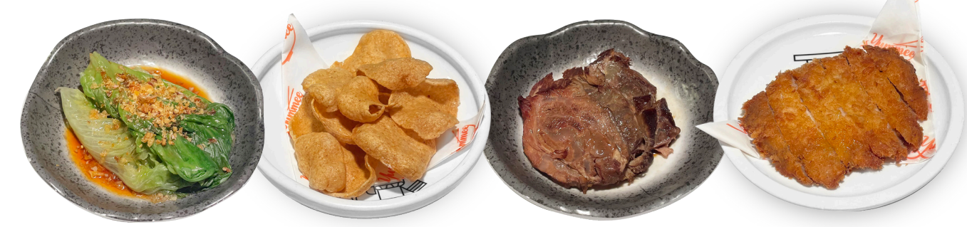
白灼時蔬 $28 Seasonal Vegetables 脆炸泰式蝦片 $28 Fried Prawn Chips 滷水牛腩 $48 Braised Beef Shank 吉列豬扒 $58 Pork Cutlet