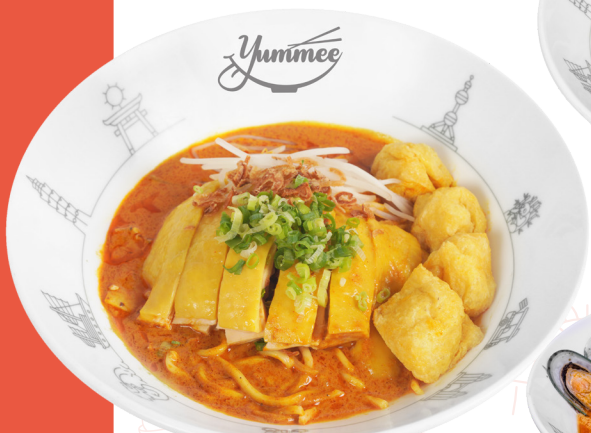
海南雞喇沙 $98 Hainan Chicken Laksa