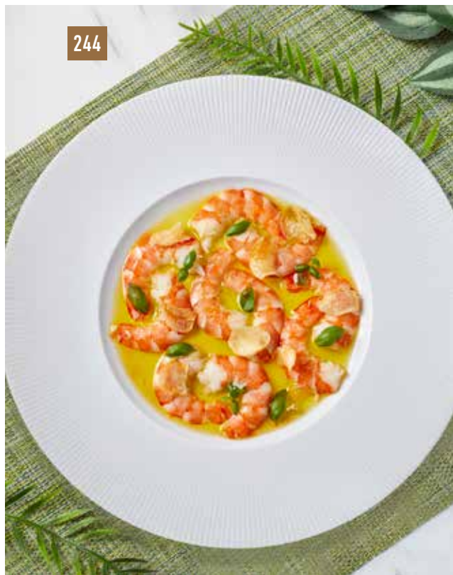
244 Warm Prawns in Olive Oil $118 人氣 香草慢煮大蝦