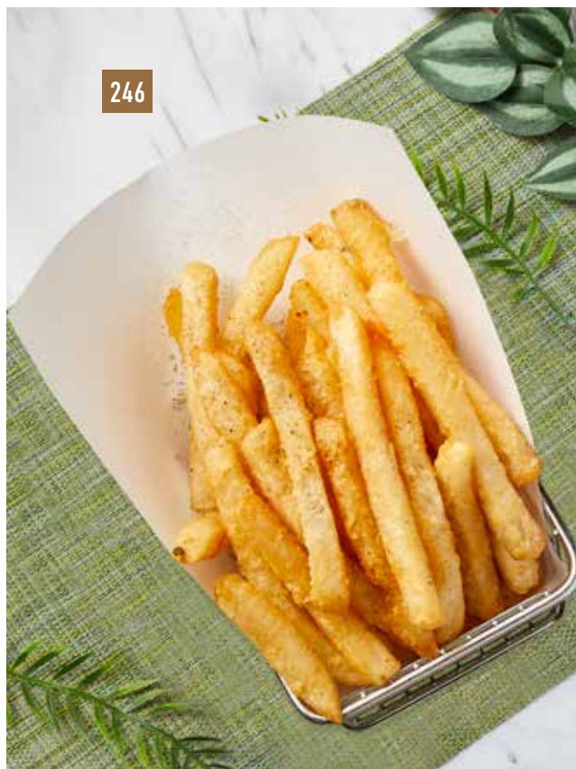
246 Crispy Fries with Black Truffle $68 Mayonnaise & Parmesan Cheese 炸薯條配黑松露蛋黃醬 及巴馬臣芝士