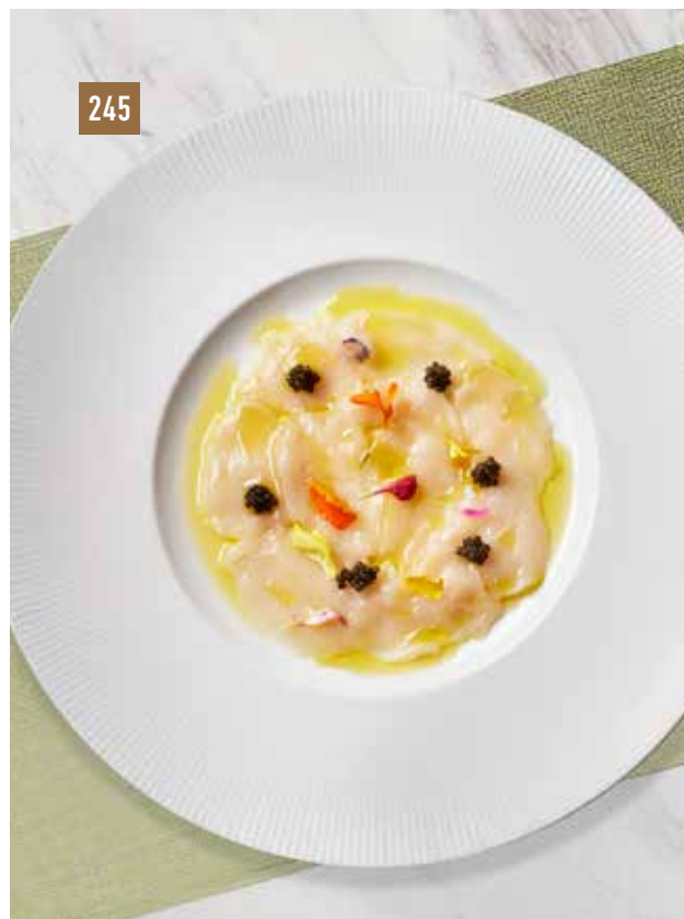
245 Scallop Carpaccio with Caviar $118 人氣 鮮帶子刺身薄片